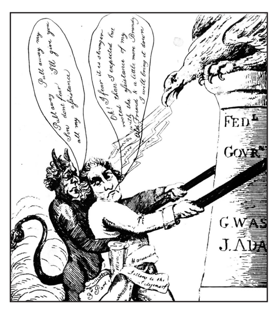
Jefferson was seen by his opponents as trying to topple the federal government.

Many waited with great apprehension to see if it would be possible to shift the political policies of the US government. The political parties of 1800 were not organized the way modern political parties are — they were more like modern political interest groups — and they were not an accepted part of a presidential election. In 1800 these political groups involved changing loyalties, back room deals, and political patronage.