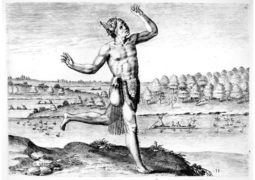
Below: Workshop of Theodor de Bry, The Conjurer , 1590.

15. Why do you think White entitled his watercolor "The Flyer"? What does that term suggest about the figure and his role within Algonquian society?