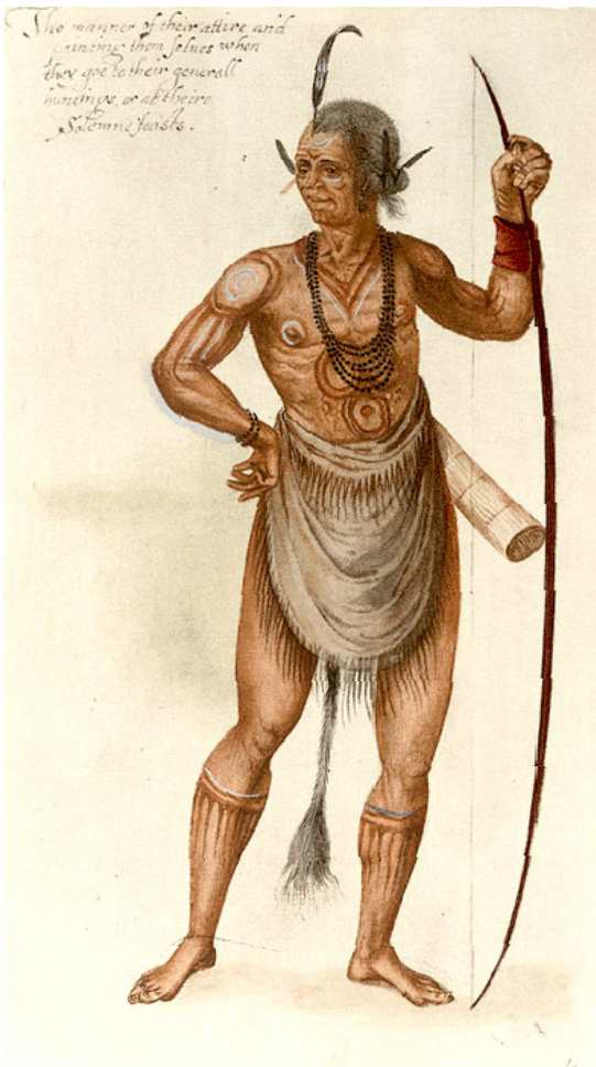
Left: John White, Indian in Body Paint (The manner of their attire...) , watercolor, ca. 1585.