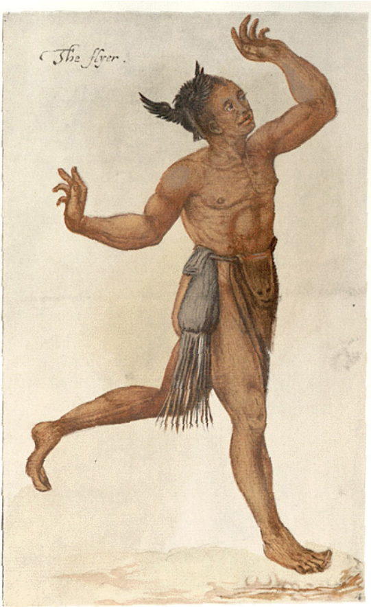
Left: John White, The Flyer , watercolor, ca. 1585.