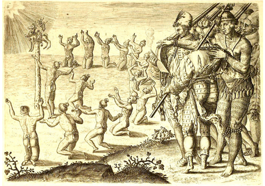
Below: Theodor de Bry, Their Solemn Ritual in Consecrating a Deerskin to the Sun , engraving after watercolor by Jacques Le Moyne, 1591.

8. What is happening in each of these pictures?