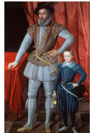
Sir Walter Raleigh; Walter Raleigh , oil on canvas, 1602

5. Unlike the illustration of the Blemmyes, White's Algonquian warrior is not shown in a landscape or in a context of any sort. Why would he have chosen to isolate his subject like this?