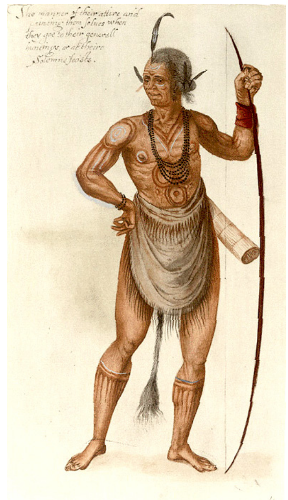
John White, Indian in Body Paint (The manner of their attire...) , watercolor, ca. 1585

On April 9, 1585, a military expedition set sail from Plymouth with the goal of fortifying and surveying the New World territory Sir Walter Raleigh had named "Virginia" after Queen Elizabeth. One member of this expedition, John White, who later became governor of the failed Roanoke colony, had the task of recording Virginia in pictures. During the summer of 1585 White produced a remarkable collection of watercolors , now housed in the British Museum, that describes the native peoples, natural history, and geography of the region. Thanks to Theodor de Bry's engravings of these watercolors, published in 1590, White's pictures would go on to have a profound impact upon how Europeans imagined nature and society in North America.