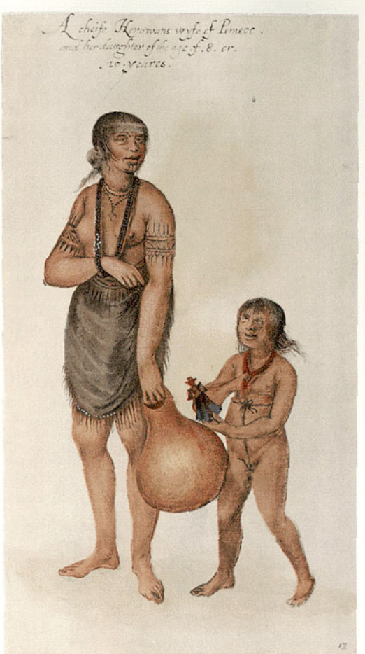
Left: John White, Indian Woman and Young Girl ( The cheife Herowans wyfe... ), watercolor, ca. 1585.