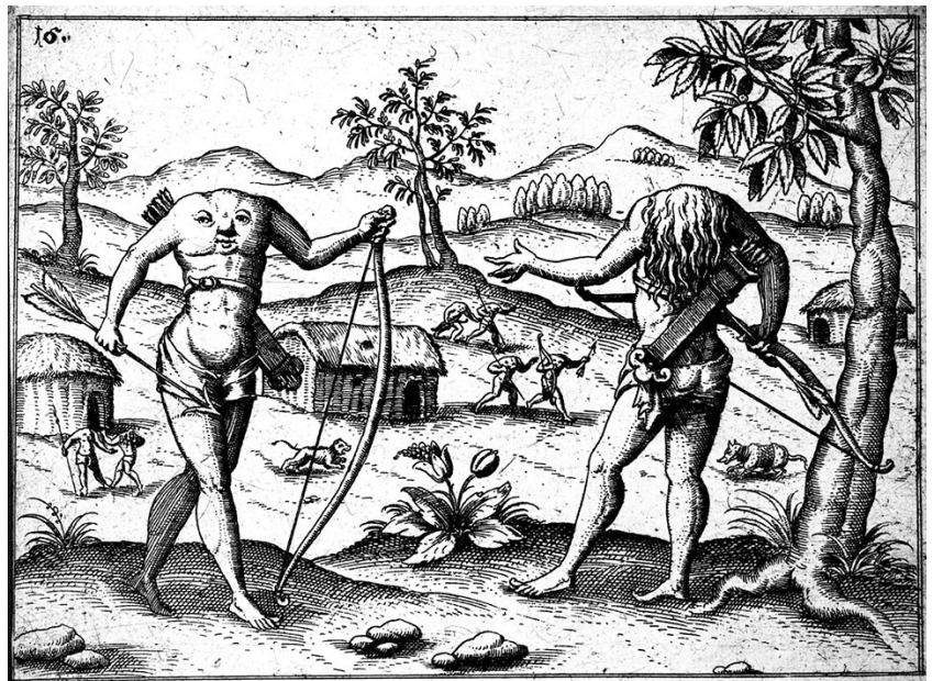
Below: Depiction of Blemmyes, engraving in a 1603 German edition of Sir Walter Raleigh’s Discovery of Guiana , 1595.

1. Why might an artist choose to represent Native Americans as Blemmyes (people who according to ancient authors lived in Africa and had their heads in their chests)?