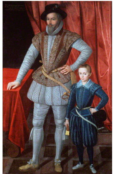
Sir Walter Raleigh; Walter Raleigh, oil on canvas, 1602