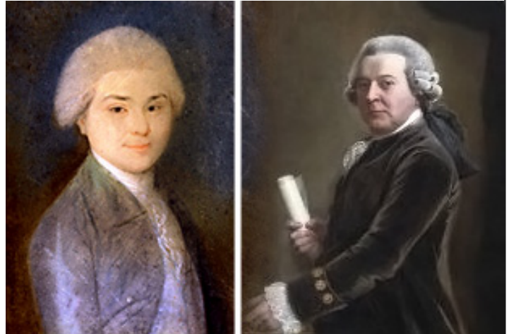
John Quincy Adams (left) and John Adams, 1783