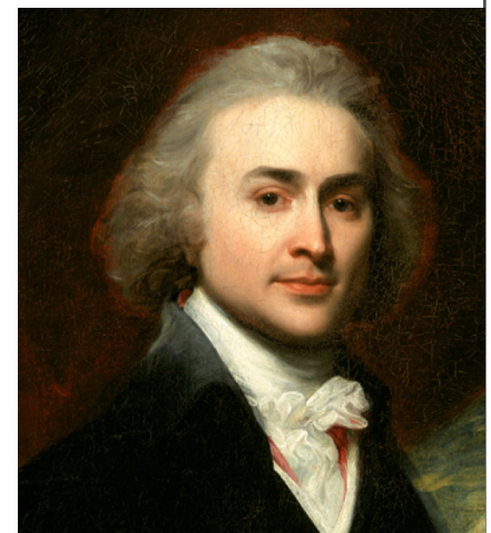
John Quincy Adams, 1796