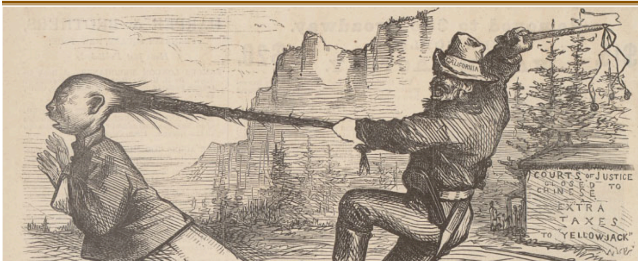
Bancroft Library, University of California, Berkeley