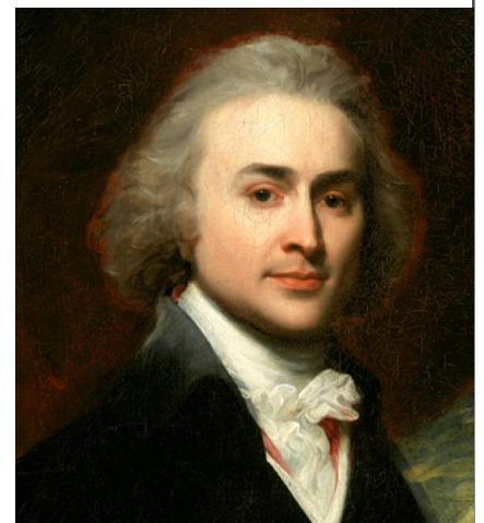
John Quincy Adams, 1796