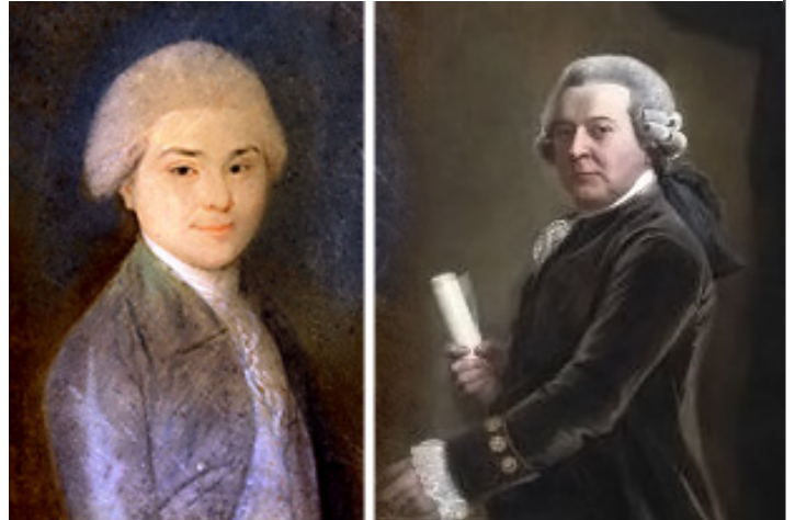
John Quincy Adams (left) and John Adams, 1783