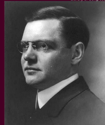
Frederick Winslow Taylor, 1911

In the primary source collection The Gilded and the Gritty: America, 1870-1912 from the National Humanities Center.