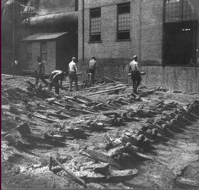
"Loading the pigs," Pittsburgh, 1905

tons of pig iron was loaded on to the cars at the rate of 47 tons per man per day, in place of 12½ tons, at which rate the work was then being done. And it was further our duty to see that this work was done without bringing on a strike among the men, without any quarrel with the men, and to see that the men were happier and better contented when loading at the new rate of 47 tons than they were when loading at the old rate of 12½ tons.