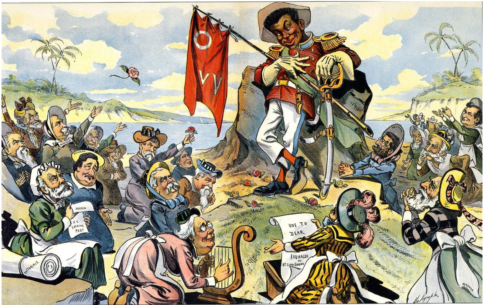
"THE IDOL OF THE AUNTIES." 8