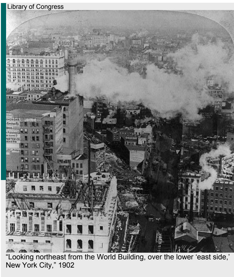
Library of Congress