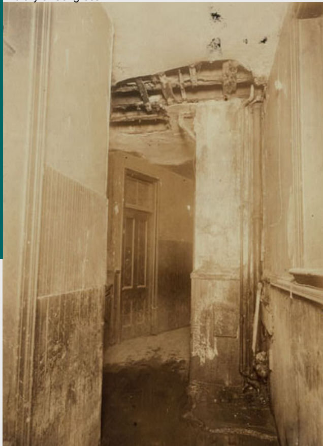
tenement hall, New York City, Feb. 1912

"But I only want you for a half a minute." And Hanneh Hayyeh dragged the owner of her palace across the threshold. "Nu? Ain't I a good painter? And all this I done while other people were sleeping