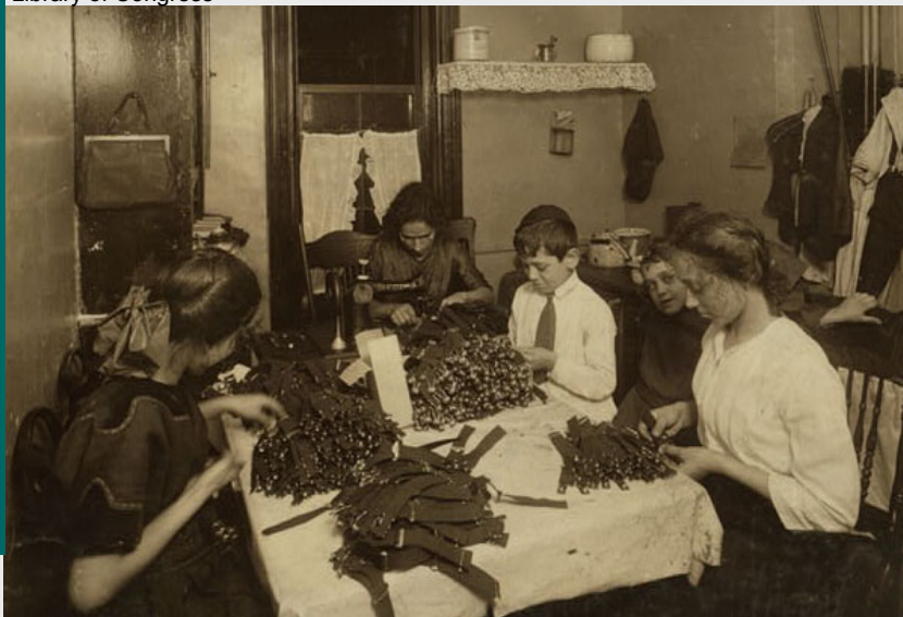
Lewis W. Hine, “Jewish family working on garters in kitchen for tenement home,” New York City, February 1912

blocks around. The grocer and the butcher and all the neighbors were jumping in the air from wonder and joy when they seen how I shined up my house.”