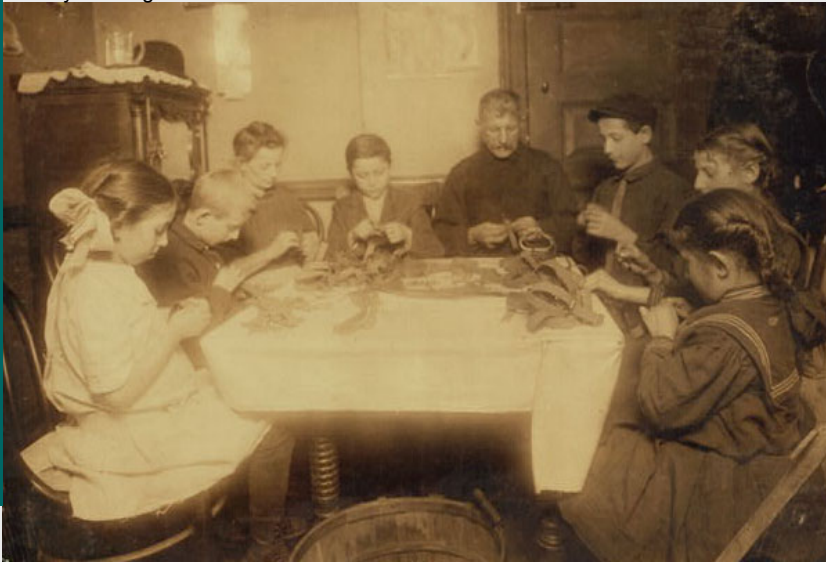
Lewis W. Hine, “9:00 P.M., Feb. 27/12. Making garters (armlets). A Jewish family and neighbors working until late at night,” New York, 1912

fashioning the pedestal of their cleanliness, from which they reach down, hoping to lift me to the height that I have created for them.