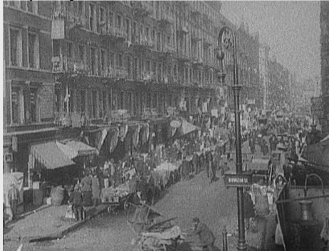
Lower East Side, New York City, between 1900 and 1915