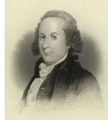
poet John Trumbull, engraving after portrait by his cousin John Trumbull, 1793

Let endless blessings round our nation rise, Cheer all our lives, and waft us to the skies! Thus strains of rapture charm'd the listening gales. While the low sun-beam glimmer'd on the vales: To rest the camp retir'd: ten-thousand fires Thro' the calm silence rais'd their bending spires: The bright moon rose; winds cool'd the cheerful even, [evening] And wide magnificence enkindled heaven.