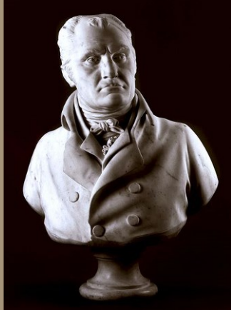
Joel Barlow, marble bust by French sculptor Jean-Antoine Houdon, ca. 1804