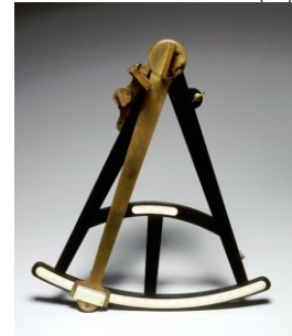
18 th -c. octant similar to that invented by Thomas Godfrey, a Philadelphia optician