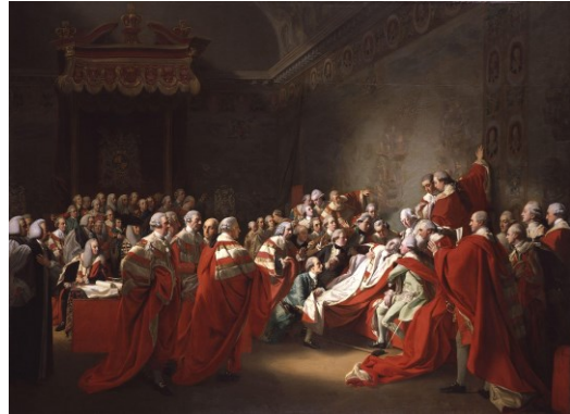
John Singleton Copley, The Collapse of the Earl of Chatham in the House of Lords, 7 July 1778 , oil on canvas, 1779-80. Encouraged by Benjamin West to study in Europe, Boston-born Copley eventually settled in England and continued his career producing portraits and expansive historical canvasses, including The Death of General [Joseph] Warren (1775, Battle of Bunker Hill in Charlestown, near Boston).