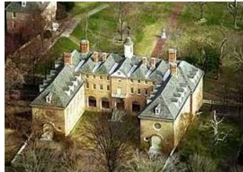
Wren Building, orig. constructed in the late 1600s, College of William and Mary, Williamsburg, Virginia

University of Pennsylvania, on the Delaware River College of William & Mary near the James River, Virginia Columbia University, New York City Dartmouth College, New Hampshire