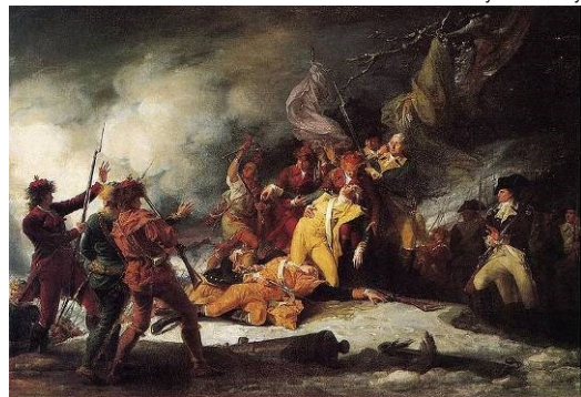
John Trumbull, The Death of General Montgomery at the Attack on Quebec [1775] , 1786. Born in Connecticut, Trumbull also spent a portion of his artistic career in Europe. Known as the "Artist of the Revolution," he painted four large Revolutionary War scenes commissioned for the U.S. Capitol rotunda