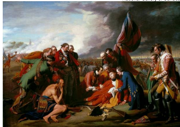
Benjamin West, The Death of General Wolfe , 1771, depicting the 1759 death of the British general during the French and Indian War. A Pennsylvania native who became the British court painter, West created many scenes of British and American military triumph.