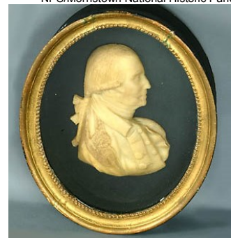
Patience Wright, wax portrait of George Washington, n.d. Born in New Jersey, Wright became widely known for her wax figures. After moving to London in 1772, she opened a wax museum.