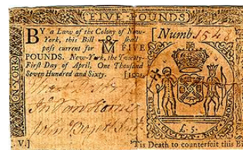
University of Notre Dame

"Trials by Juries": Britain had changed the courts in which trade violations would be prosecuted—from colonial courts that guaranteed trial by jury, to the naval "vice-admiralty" courts in which verdicts were delivered by the judge only.