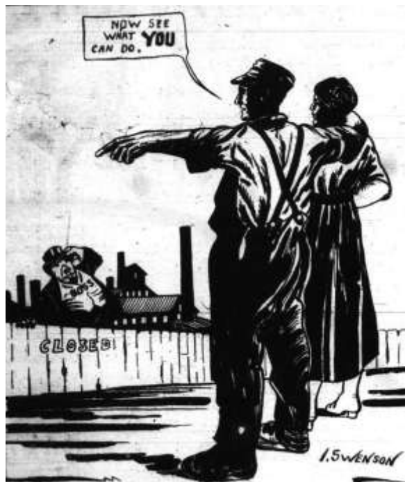
Seattle Union Record, February 6, 1919

And that is why we say that we are starting on a road that leads— NO ONE KNOWS WHERE!