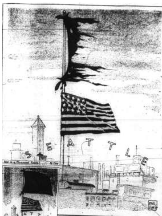
“Our Flag Is Still There,” Feb. 11, 1919