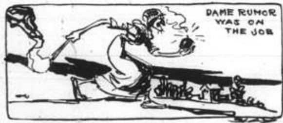
DAME RUMOR WAS ON THE JOB