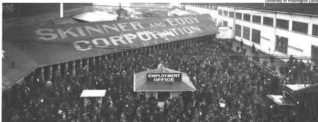
Workers at city's largest shipyard, n. d. (detail). In the Seattle "general strike," non-shipyard workers struck in solidarity with the shipyard workers.

From 8 a.m. till 9 p.m. Sunday, in the Labor Temple [main union hall], delegates from 110 unions discussed the whole situation and laid their plans. All decisions were made with one voice and a remarkable unanimity was demonstrated throughout the meeting. . . . Tremendous cheering greeted the treble [three-item] announcement that by a big majority the streetcar men had voted to quit, that the longshoremen's [waterfront workers] union had decided to strike in spite of its international officers, and that, for the first time in its history, the typographical union had joined in the general strike movement.