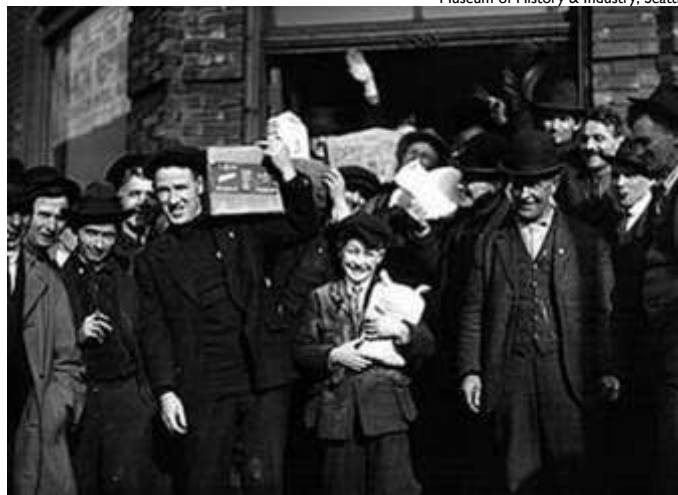
Strikers stockpiling groceries in preparation for the city shutdown