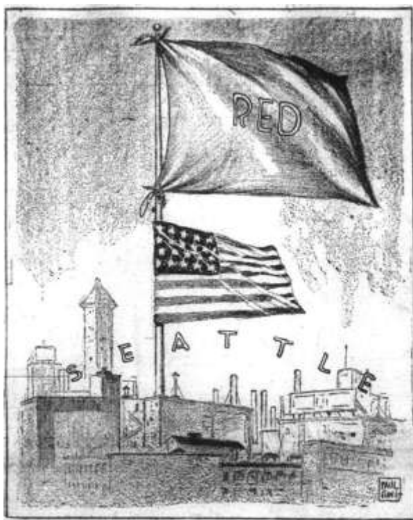
“Not in a Thousand Years!” Feb. 6, 1919