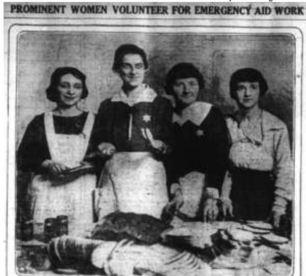
Wives of city leaders providing meals for policemen and other law enforcement personnel