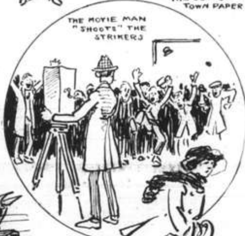
THE MOVIE MAN "SHOTS" THE STRIKERS