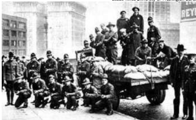
Machine gun unit organized in the Seattle police force before the strike