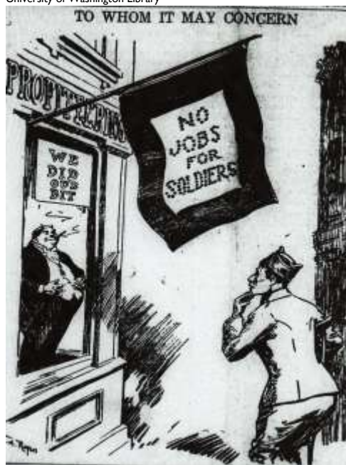
Seattle Union Record, March 8, 1919

A large colored poster showing a soldier, a sailor, and a worker arm in arm, with the motto, “Together We Win,” was held up at a window while the men passed by a member of the strike committee.