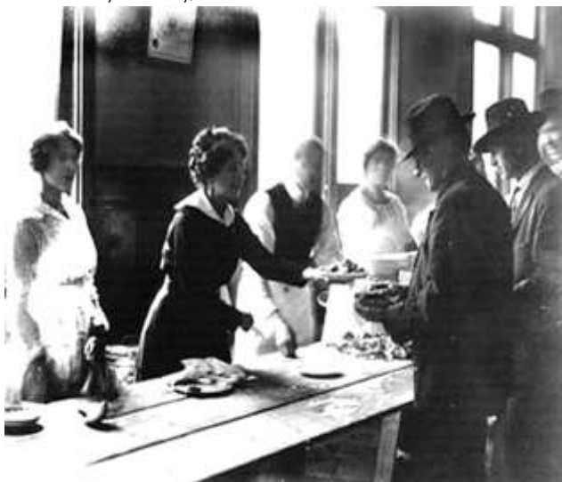
Meals served in city’s union halls for striking workers