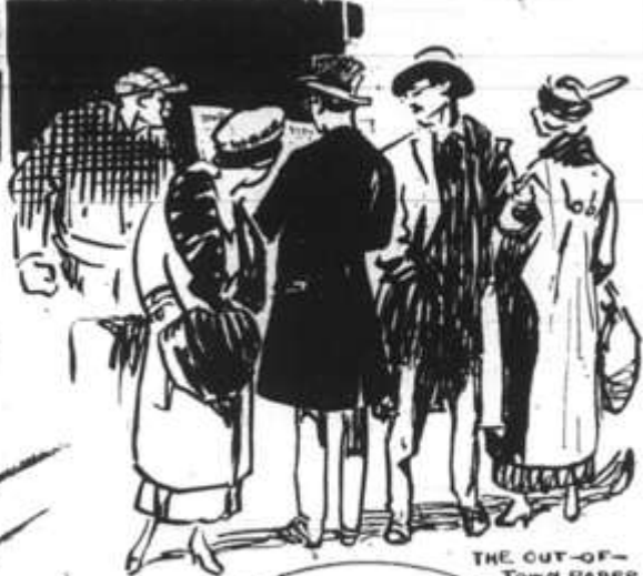
THE OUT-OF-TOWN PAPER

MY DEAR, AREN'T YOU AFRAID TO BE ON THE STREETS?