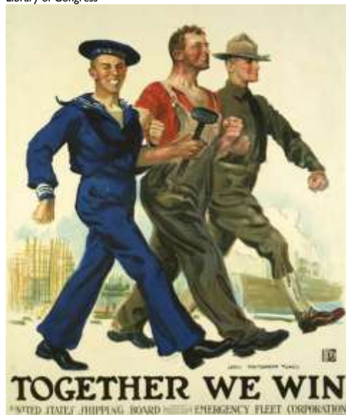
Poster, U.S. Shipping Board Emergency Fleet Corp., ca. 1918