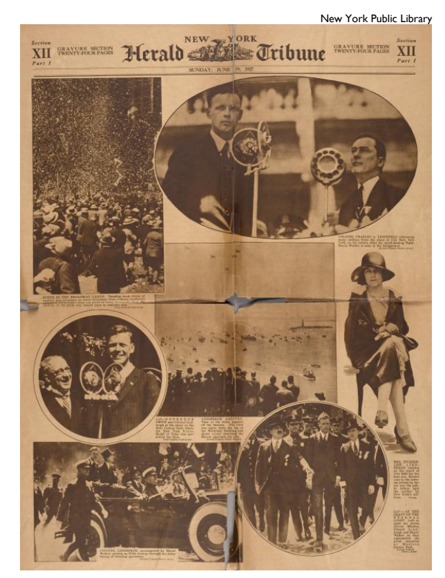
Welcoming ceremonies for Lindbergh in New York City and Washington, DC, New York Herald Tribune, June 19, 1927

About 5 P.M. he approached St. Louis in a wet fog. He dropped lower and circled the city. As at New York the sky was dotted with planes. Streets and house tops were massed with people. As he landed at Lambert Field a cordon of troops protected him from the eager crowds.