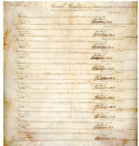
Virginia's Ratification of the Bill of Rights, December 15, 1791