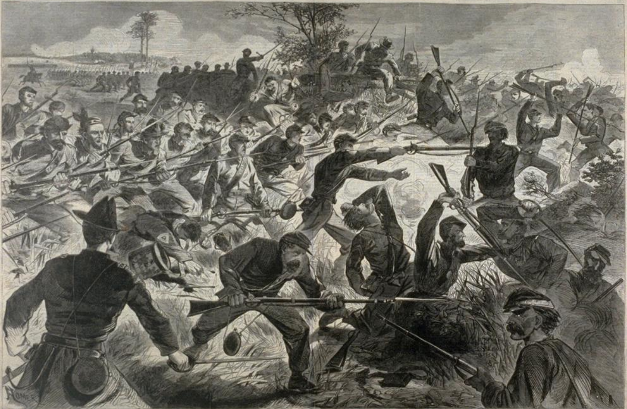
THE WAR FOR THE UNION, 1862—A BAYONET CHARGE.—[See Page 439.]