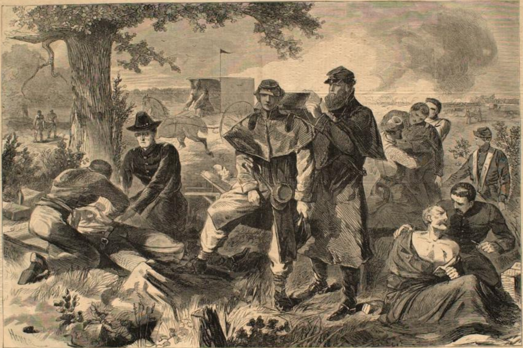
THE SURGEON AT WORK AT THE REAR DURING AN ENGAGEMENT.—[SEE PAGE 430.]