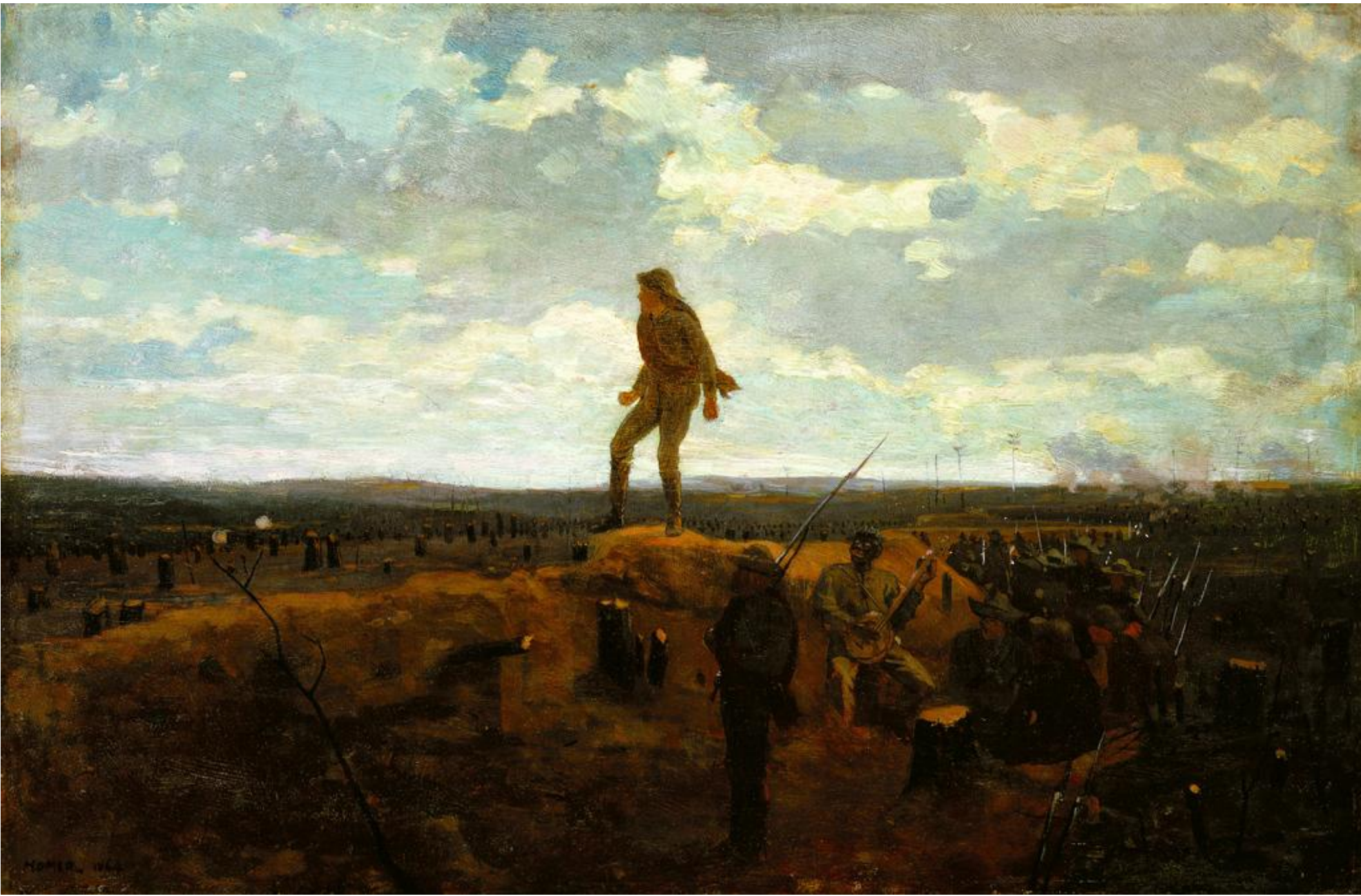
Defiance: Inviting a Shot Before Petersburg (painting, Detroit Institute of Art, 1864)