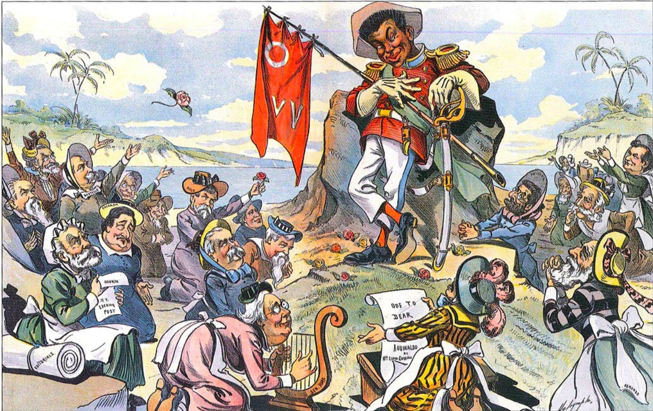
"THE IDOL OF THE AUNTIES." 8